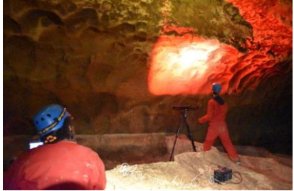
Cave Saint Marcel, Ardèche

In this internship, the student will develop in the group, one or several model experiments, reproducing dissolution erosion phenomena. To decrease the timescales, fast dissolving materials like salt and plaster will be used. Hydrodynamic properties of the flows will be characterized and the 3D shape evolution of eroded surfaces will be recorded. Several experimental projects are possible, depending on the water flow configuration (thin film, turbulent current ...).