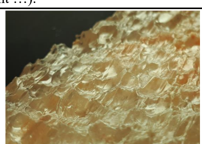
Crests formed by dissolution of salt on water, when driven by the solutal convection